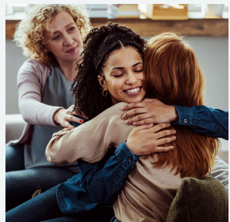
JOIN A SUPPORT GROUP

Activities like these are great for lowering stress, boosting mood and making you the best caregiver you can be. Learn more at www.nia.nih.gov/health/caregiving