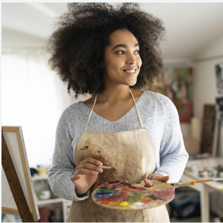
MAKE THE TIME FOR HOBBIES