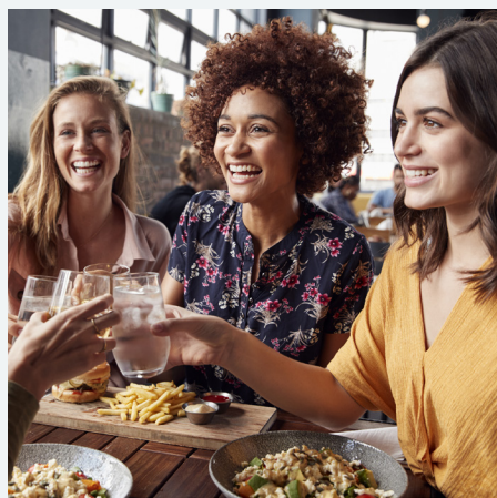
MEET UP FOR LUNCH WITH FRIENDS